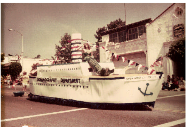
1980 – Oceanography Department