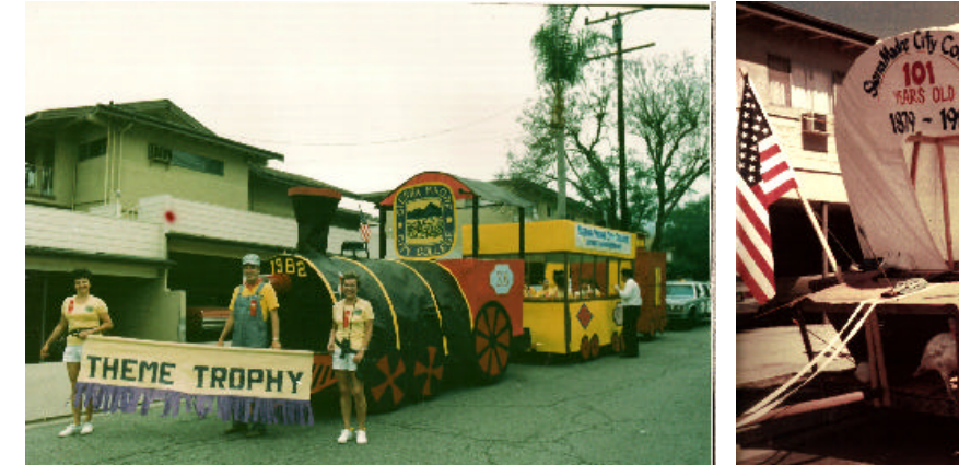
1982 - School of Engineering