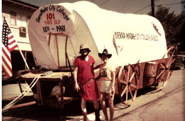
1981 - SMCC Centennial Celebration