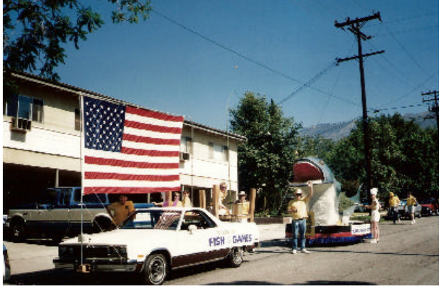
1989 - School of Fish and Games