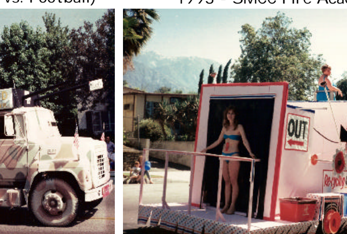
1991 - ROTC at SMCC