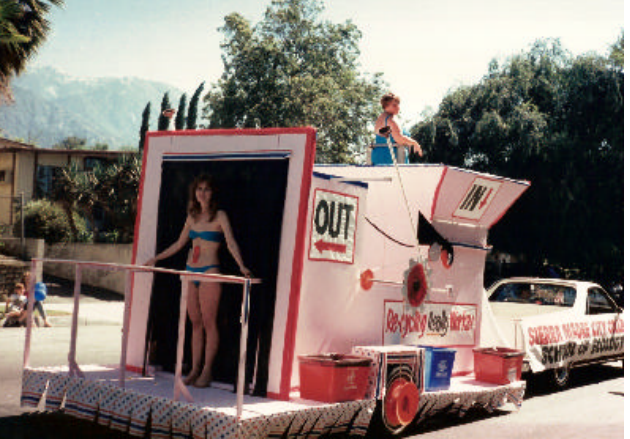
1990 - School of Ecology