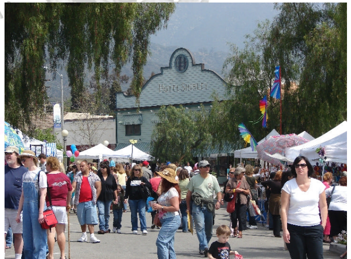
Vine and Festival Photos by Bill Coburn, high resolution images available in .tif, .jpg, .bmp and .pdf format